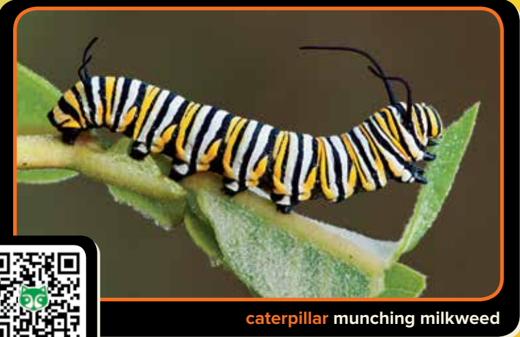
caterpillar munching milkweed