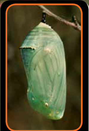
chrysalis with adult forming inside