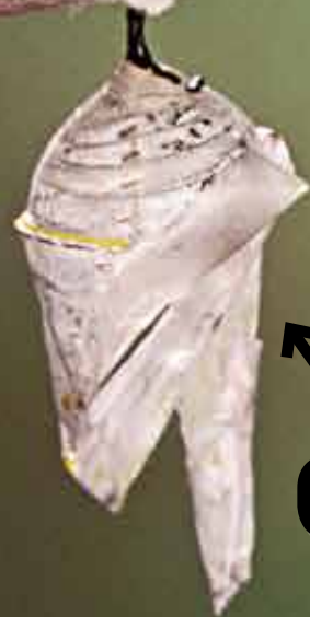
chrysalis after adult has crawled out